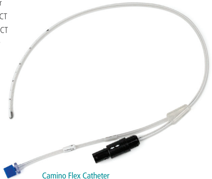
Camino Flex Catheter